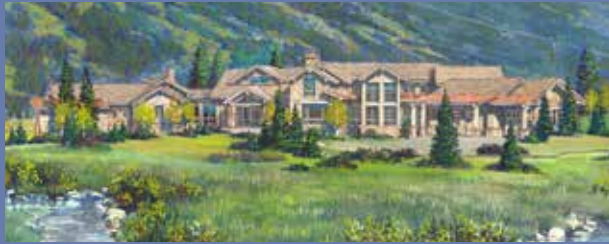
Shooting Star Lot 46 7140 Jensen Canyon Road